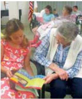
Philipsburg Elementary School students